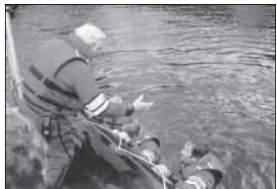
Drysuits provide thermal protection in the case of accidental immersion

Drysuits alone do not provide adequate insulation or hypothermia protection. Thermal underwear must be worn beneath the drysuit to provide insulation. In areas of very cold water temperatures, layering of underwear is recommended. Always use underwear that is specifically designed to keep you warm in a wet environment.