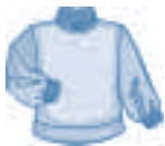
Polypropylene underwear gives you a heatloss advantage